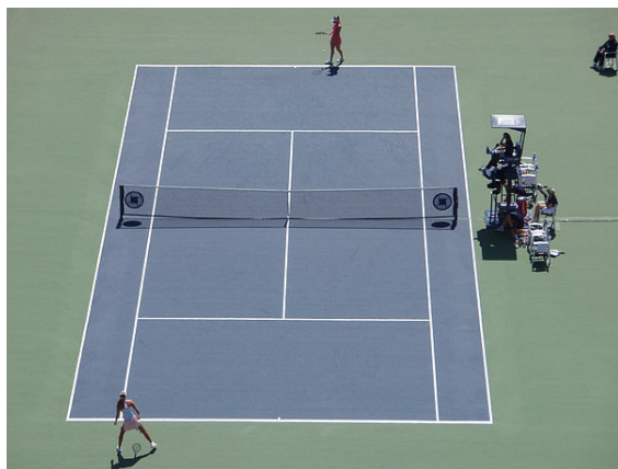
Two players before a serve