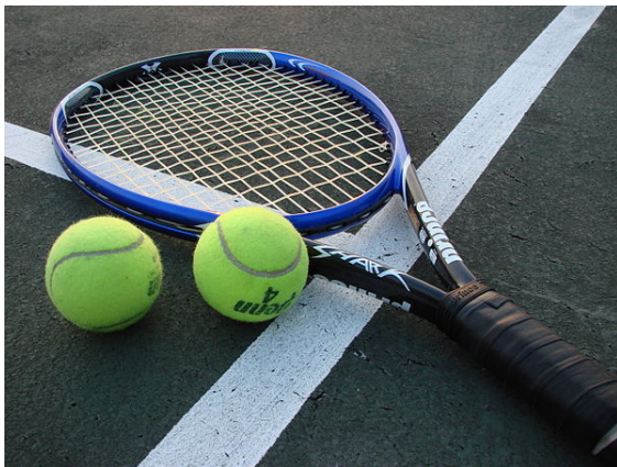
A tennis racquet and balls.

The rules regarding racquets have changed over time, as material and engineering advances have been made. For example, the maximum length of the frame had been 32 inches until 1997, when it was shortened to 29 inches. [37]