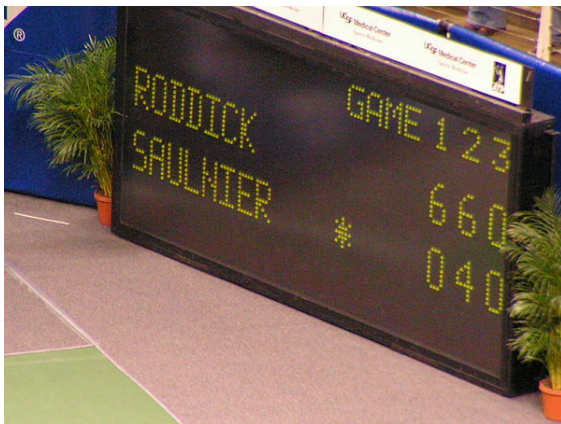
The scoreboard of a match between Andy Roddick and Cyril Saulnier.

A game consists of a sequence of points played with the same player serving. A game is won by the first player to have won at least four points in total and at least two points more than the opponent. The running score of each game is described in a manner peculiar to tennis: scores from zero to three points are described as "love", "fifteen", "thirty", and "forty" respectively. If at least three points have been scored by each player, making the player's scores equal at forty apiece, the score is not called out as "forty-forty", but rather as "deuce". If at least three points have been scored by each side and a player has one more point than his opponent, the score of the game is "advantage" for the player in the lead. During informal games, "advantage" can also be called "ad in" or "van in" when the serving player is ahead, and "ad out" or "van out" when the receiving player is ahead.